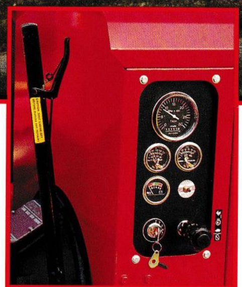
Amp, hourmeter, tachometer, oil pressure, and water temperature gauges are all standard.