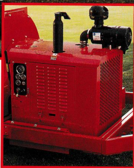
The Pro Chip 495 diesel engine, along with the chipper design, provides ample horsepower to handle up to 14"-diameter brush and limbs.

Performance, safety, serviceability, and the revolutionary Electronic Auto Feed System makes the Pro Chip 495 a best buy.