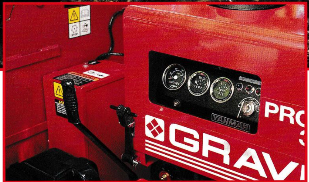
Full instrumentation and operator-friendly controls for ease of operation.

ICC-approved taillights, stoplights, and turn signals.